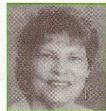
BY IVETTE RICCO